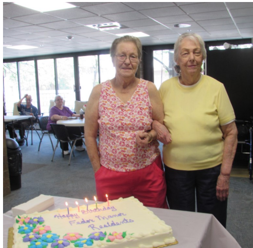
JUNE BIRTHDAY BUNCH